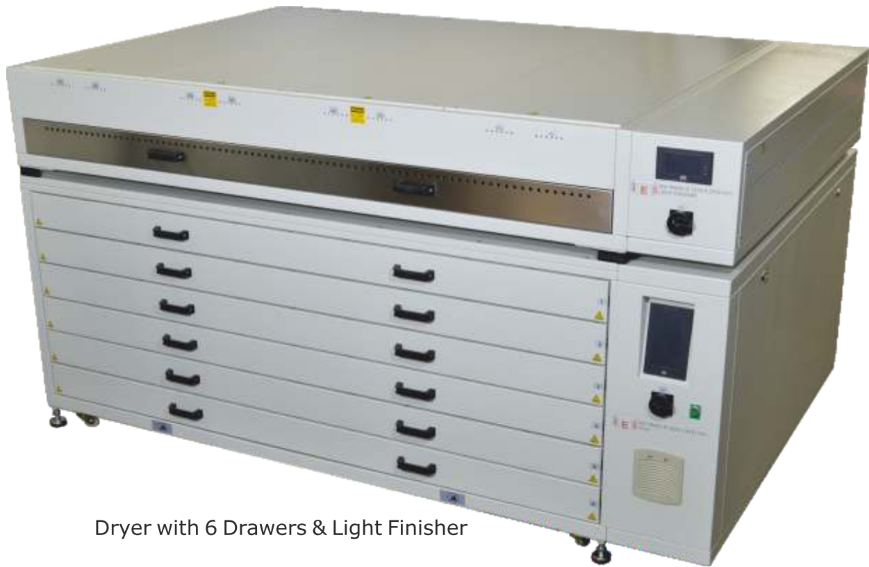
Dryer with 6 Drawers & Light Finisher

3ES-PROIII-D is designed for drying photopolymer plates up to a format size of 1060 x 1530 mm.